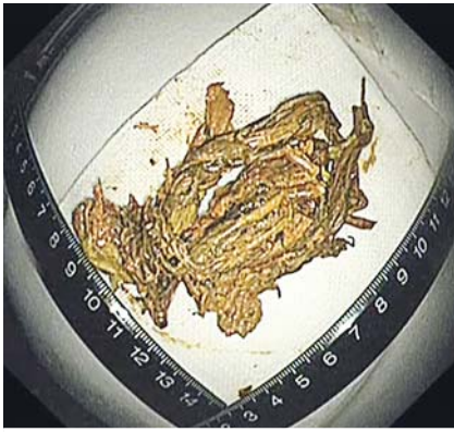
► Fig. 4 Bezoar of size 2 cm × 3 cm × 8 cm.