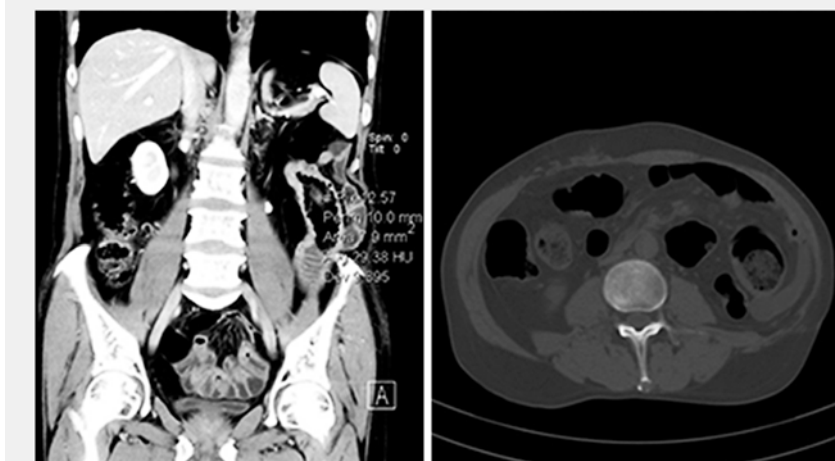
► Fig. 1 Computed tomography (CT) scan shows a foreign body in the efferent loop and uneven thickening of the gastric wall, in a patient who had undergone Billroth II surgery 11 months previously.

Therefore, stitch scissors were used to cut down the residual sutures. Then we trapped the bezoar and dragged it out using a snare (► Video 1). The procedure took 40 minutes. The patient's abdominal pain was relieved promptly and he received medical therapy with aluminum sulfate prokinetics and lansoprazole. Re-examination 1 month later showed both the afferent loop and efferent loop were clear without any discomfort. Of note, we took biopsies during every esophagogastroduodenoscopy and they all revealed chronic inflammation.