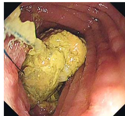
► Fig. 3 A giant bezoar entangled with sutures within the efferent loop.

Efferent loop syndrome refers to purely mechanical complications in efferent loops following gastrojejunostomy, and bezoars are rare causes of efferent loop syndrome [1]. This is the first case of abdominal pain induced by a bezoar caused