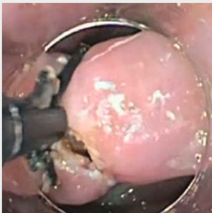
► Video 1 Complete procedure for cricopharyngeal myotomy with the Clutch Cutter.

was stopped immediately during the procedure through coagulation with the closed CC. Mean hospital stay was 3 days (range 2–4 days). All patients had symptomatic relief after myotomy with the CC, and a single patient experienced a diverticulum recurrence 10 months after the initial myotomy which was then successfully treated with a second diverticulotomy using the CC.