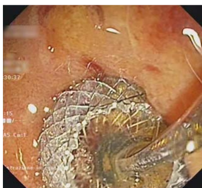
► Fig. 5 Endoscopic view of choledocho-duodenostomy showing proximal flange of the stent released and correctly in place in the duodenal bulb.

A jaundiced 82-year-old-woman was diagnosed with a cephalopancreatic, locally advanced adenocarcinoma. Endoscopic retrograde cholangiopancreatography was planned, but biliary cannulation was not achieved because of a large periampullary diverticulum (► Fig. 1 ). We therefore decided to perform endoscopic ultrasound (EUS)-guided biliary drainage using an 8-mm electrocautery-tipped lumen-apposing metal stent (LAMS; AXIOS-EC, Boston Scientific, Marlborough, Massachusetts, USA). The dilated common bile duct (CBD) (► Fig. 2 ) was accessed from the bulb