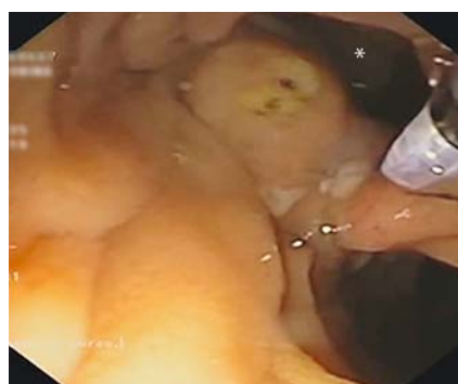
► Fig. 1 Endoscopic view of the major papilla located on the inferior margin of the diverticulum (*). The common bile duct could not be cannulated with the guide-wire because of marked tortuosity of the distal part.