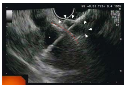
► Fig. 4 Endoscopic ultrasound view of the distal flange of the stent (arrowheads) fully released outside of the common bile duct (CBD; *). The wall of the CBD is highlighted by the red dashed line.