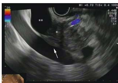
► Fig. 2 Endoscopic ultrasound view of a 40-mm solid inhomogeneous hypoechoic lesion with irregular borders (*) in the head of the pancreas, infiltrating the portal vein (arrow) and the intrapancreatic common bile duct, and dilated up to 18 mm at the upper/middle third (**).