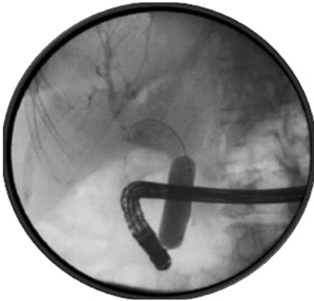
► Fig. 1 Dilation of the common bile duct to 18 mm using a CRE balloon.

proach to the papilla and eventually relieve biliary obstruction, a surgical laparoscopic gastrotomy of the excluded stomach was performed uneventfully.