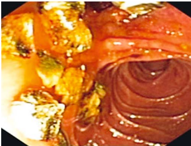
► Fig. 3 Sequential extraction of the gallstone using a Dormia basket and then a balloon catheter.

lities related to the type of endoscope used. On the other hand, GERCP offers the full range of technical capabilities of ERCP, including single-operator cholangioscopy.