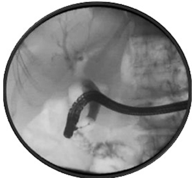
► Fig. 4 Main biliary tract and cystic stump completely empty of any stone residue. We noted the duodenoscope position from the left side through the gastrotomy.

In conclusion, combining advanced endoscopic techniques to treat a complicated gallstone disease is possible, and bariatric surgery such as Roux-en-Y bypass does not represent a contraindication anymore, even in the case of a large gallstone requiring laser lithotripsy.