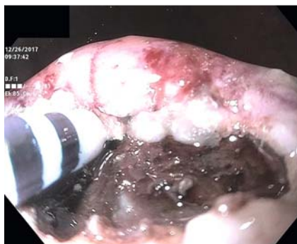
► Fig. 1 Accessing the submucosal space for endoscopic full-thickness resection.