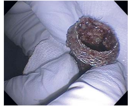
▶ Fig. 1 The lumen-apposing metal stent after endoscopic removal, with evidence of significant tissue ingrowth through the stent.

A 31-year-old woman with a history of alcohol pancreatitis presented with abdominal pain. During her initial admission, she developed an 8.2-cm peripancreatic fluid collection. She underwent successful endoscopic ultrasound-guided drainage of the collection with a 15 mm lumen-apposing metal stent (LAMS). Though instructed to return, the patient was lost to follow-up. She returned to an outside hospital 7 months later with recurrent pancreatitis secondary to alcohol use. Imaging demonstrated resolution of the peripancreatic collection, with the cyst-gastrostomy stent still in situ. The initial attempt at stent removal was unsuccessful. She was then transferred to our institution.