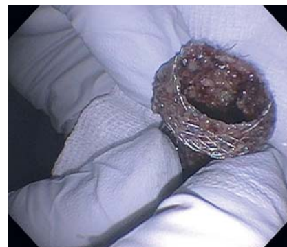
▶ Fig. 1 The lumen-apposing metal stent after endoscopic removal, with evidence of significant tissue ingrowth through the stent.

A 31-year-old woman with a history of alcohol pancreatitis presented with abdominal pain. During her initial admission, she developed an 8.2-cm peripancreatic fluid collection. She underwent successful endoscopic ultrasound-guided drainage of the collection with a 15 mm lumen-apposing metal stent (LAMS). Though instructed to return, the patient was lost to follow-up. She returned to an outside hospital 7 months later with recurrent pancreatitis secondary to alcohol use. Imaging demonstrated resolution of the peripancreatic collection, with the cyst-gastrostomy stent still in situ. The initial attempt at stent removal was unsuccessful. She was then transferred to our institution.