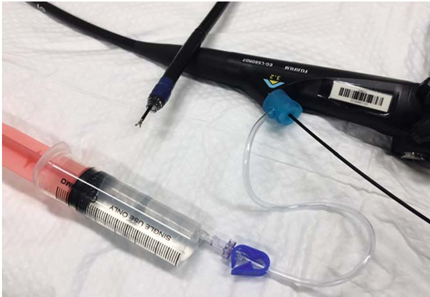
► Fig. 2 Gel immersion endoscopy equipment. It is important to inject the gel (OS-1 JELLY; Otsuka Pharmaceutical Factory, Tokushima, Japan) continuously with hemostatic forceps inserted through the accessory channel. The BioShield-irrigator (US Endoscopy, Mentor, Ohio, USA) is necessary to perform gel immersion endoscopy.