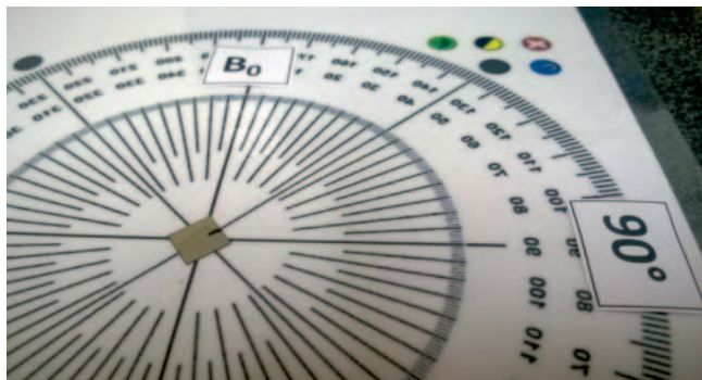
► Fig. 2 Laminated angle scale with a metallic steel plate positioned on 45°. This position describes the angle between the marker in the middle of the plate towards B_0 .

SP – Steel Plates; F_G – weight forces; F_T – translational force; \sigma_{FT} – standard deviation; M – torque. 1 extrapolated values of steel plate 11.