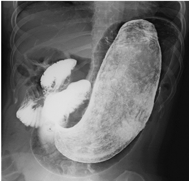
► Fig. 1 Upper gastrointestinal series, showing a giant mass consisting of foreign matter, measuring about 290 × 100 mm. The mass was associated with calcification and occupied the entire stomach.

gastrointestinal endoscopy (► Fig. 2 ) confirmed the presence of a giant gastric trichobezoar extending from the gastric cardia to the gastric angle.