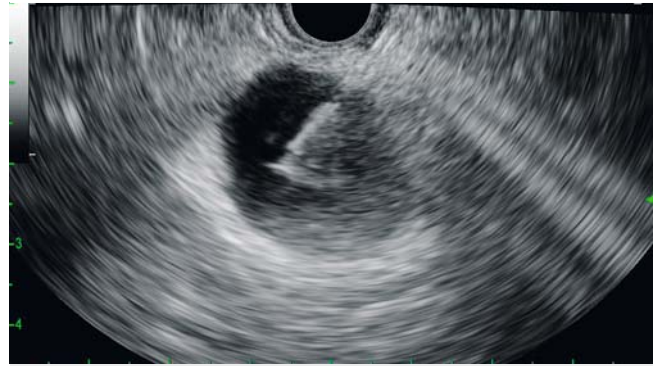
► Fig. 3 EUS image of the microforceps being passed into intracystic space.

A 55-year-old female underwent EUS for evaluation of a pancreatic cystic lesion with a nonenhancing solid component detected by MRI. EUS evaluation revealed a cystic lesion with thick septations and an associated mural nodule (► Fig. 4 ). Histopathology obtained by MFB (Moray Micro Forceps, US Endoscopy, Mentor, Ohio, United States) revealed a cyst lined by bland cuboidal epithelium without dysplasia, however, spindle cells within the cyst wall expressed nuclear estrogen receptors consistent with a MCN. The patient underwent distal pancreatectomy with splenectomy and surgical pathology confirmed a 15-mm MCN with pancreatic intraepithelial neoplasia, however, no evidence for malignancy.