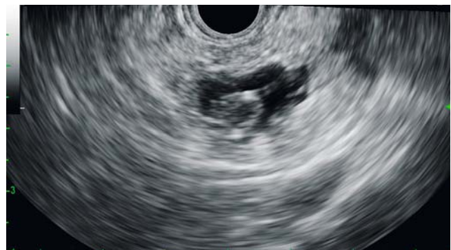
► Fig. 4 EUS image of a MCN with thick septations and mural nodule.