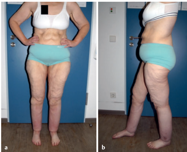
► Fig. 2 Patient from ► Fig. 1a and ► Fig. 1b , 14 months after gastric bypass surgery.

to convince the patient that the proposed liposuction would not achieve any significant and certainly not a permanent improvement and that bariatric surgery – embedded in a long-term overall concept – was the better alternative treatment. The patient agreed with our opinion and was prepared for a gastric bypass operation within the context of our multimodal obesity programme. Surgery was performed a few months after discharge from the Földi Clinic.