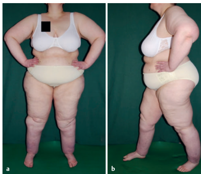
► Fig. 1 Patient who attended a large German dermatology clinic (specialising in the treatment of lipoedema).

Nearly every week in our clinical practice we see that the recommendation in the S1 Guideline Lipoedema for a “strict selection” of patients if the BMI is over 32 kg/m 2 , is merely smoke and mirrors. We regularly see severely obese patients who come to us with the intense desire for liposuction. Equally regularly, we also see however, that these morbidly obese patients have received an expert report from colleagues who practice liposuction, stating that liposuction is the only helpful option; patients with a BMI of 40, 50 or 60 kg/m 2 , patients whose report gives the diagnosis of lipoedema, but not the diagnosis of obesity. This approach is also clear in the