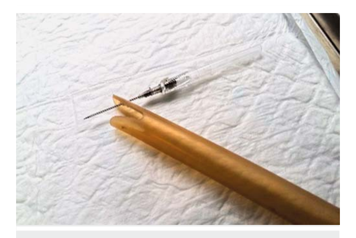
▶ Fig.1 The external end of the guidewire inserted through a hole made through an 18G catheter at the end of the long blade of the plastic diverticuloscope (Cook Medical, Limerick, Ireland).