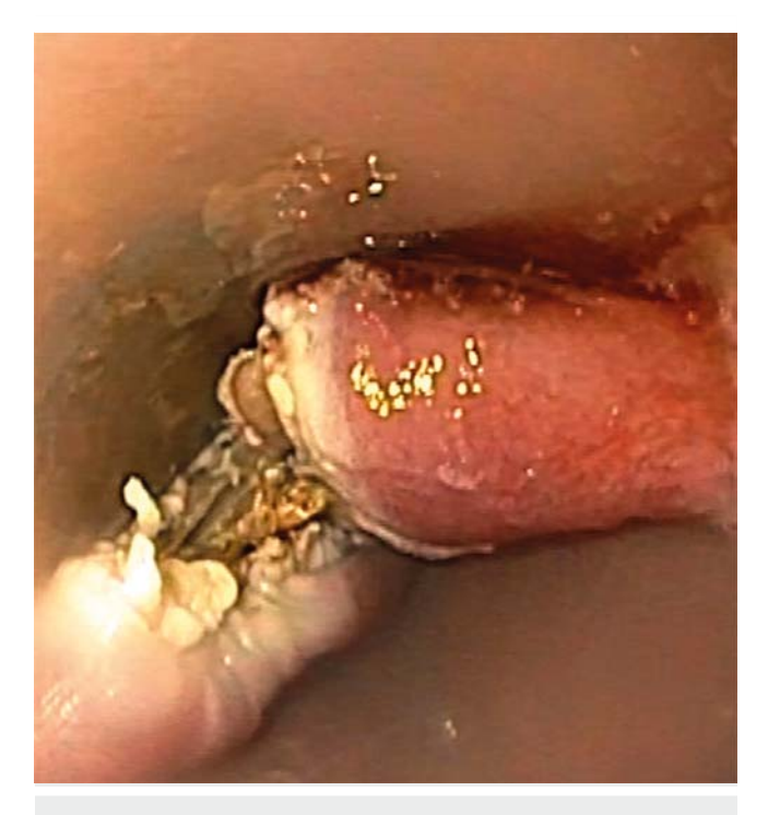
Fig.4 Appearance of the septum after cutting with Ligasure.

Most early complications were mild: odynophagia (21.5%) and cervical pain (5%) that resolved in <72 hours with first-level analgesia. However, two males (2.5%) presented iatrogenic esophageal microperforation in the first hours after treatment, requiring hospital admission for 8 and 12 days, respectively. These patients reported thoracic or interscapular pain and low-grade fever with leukocytosis, and small peridiverticular air bubbles were evident on computed tomography, despite placement of a clip in both cases. Neither required surgical or endoscopic procedures, and evolved well with conservative treatment that included fasting and antibiotic therapy. One pa-