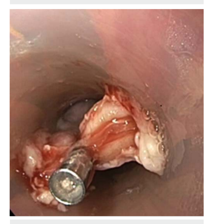
Fig. 5 After cutting, a clip (Resolution Clip, Boston Scientific, Natick Massachusetts, United StatesA) can be inserted, depending on the preference of the endoscopist, to avoid perforations.

tient, with a 2-cm ZD, who received a single cut, had ankylosing spondylitis with significant deformity and cervical-thoracic rigidity that made maneuvers difficult during the intervention. The other patient, with a 3.5-cm ZD, was treated with two cuts, without abnormalities being detected during the intervention.