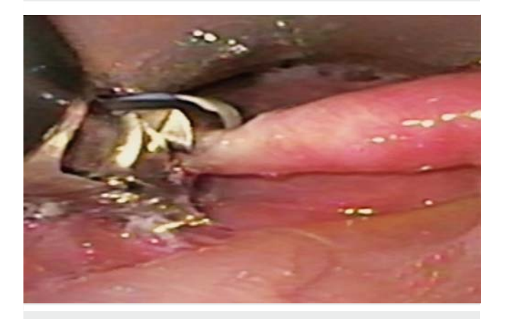
▶ Fig. 3 When the Ligasure reached the middle zone of the EDS, the blades were opened and closed on the tissue.

gasure (LS1500, Covidien, Medtronic, Minneapolis, Minnesota, United States), a system imported from laparoscopic surgery, has shown very good results in small series [8 – 10]. We present the largest series of patients with ZD treated by endoscopic diverticulotomy with Ligasure (EDVL) with a long follow-up.