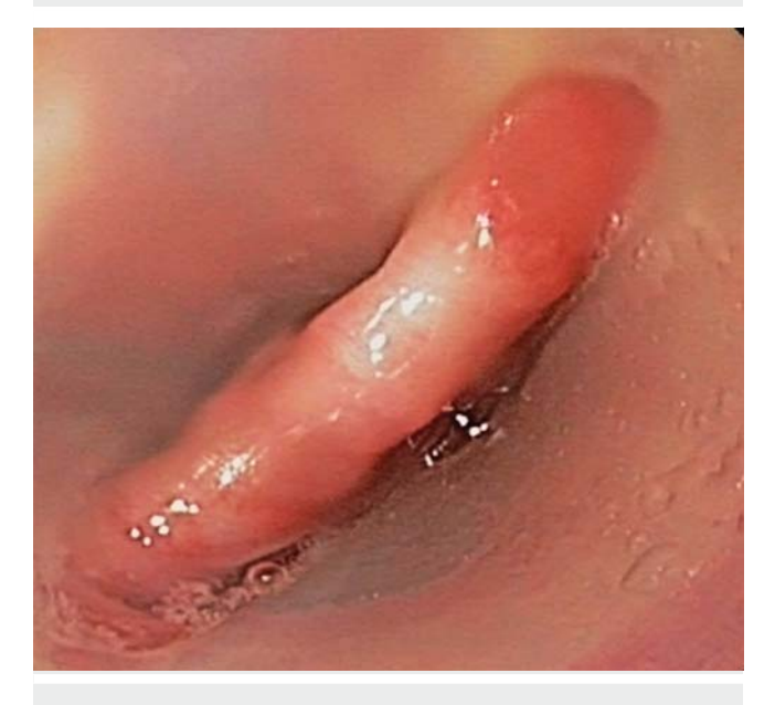
▶ Fig.2 The esophageal-diverticular septum was isolated between the two blades after gentle advance of the diverticuloscope until the long blade fit into the esophageal lumen and the short blade into the diverticulum.