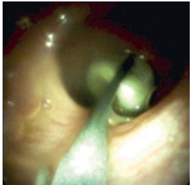
► Fig. 2 Digital cholangioscopy showing a residual stone that was found within the cystic stump.

formed for management of difficult biliary stones and for evaluation of biliary strictures [11]. However, POC has also been described in evaluation of residual stones that are missed with cholangiogram. In a multicenter study evaluating POC for a variety of indications, 11% of patients (7/66) had bile duct stones identified only by POC that were missed on ERCP [5]. In a study of patients with primary sclerosing cholangitis, 30% of patients (7/23) were found to have stones with POC that were missed with cholangiography [26]. Lee et al. analyzed a group of 64 patients that had undergone mechanical lithotripsy and found that 28.3% (13/46) had residual stones seen with POC that were missed with an OC [7]. Itoi et al. assessed residual bile duct stones found with POC in comparison to balloon cholangiography in a retrospective study of 108 patients; they found that 24% of patients (26/108) had residual stones seen with POC that were missed with balloon-occluded cholangiography [6]. The residual stones ranged in size from 2 to 8 mm with a mean of 4.8 mm. The authors found that frequency of