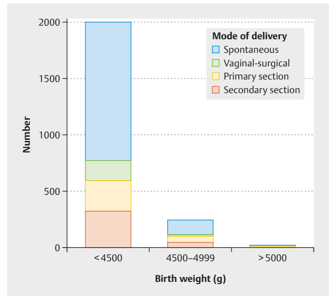
► Fig. 1 Representation of the mode of delivery in the weight classes 4000–4499 g, 4500–4999 g and \geq 5000 g. Primary and secondary sections were performed more frequently with an increasing birth weight.

All analyses were performed using IBM SPSS Statistics 25.0 (IBM, Armonk, New York, USA).