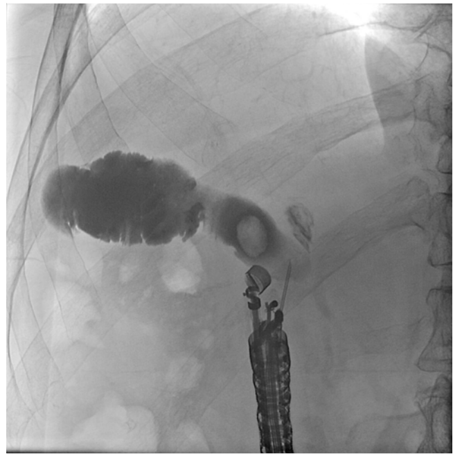
► Fig. 1 EUS-guided needle placement into the gallbladder confirmed with contrast injection under fluoroscopy.

Statistical analyses were performed using Stata version 15.1 (StataCorp, Texas, United States). All continuous variables are expressed as mean \pm standard deviation and categorical variables are expressed as proportions (%). Because of a small num-