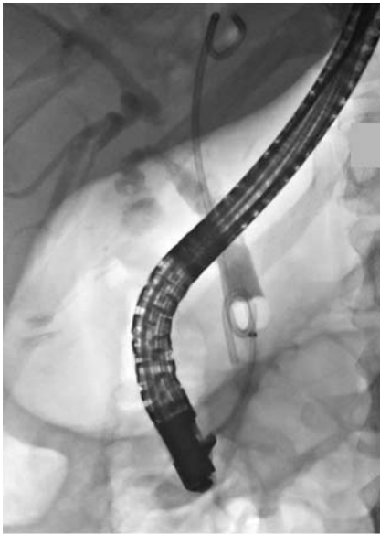
► Fig. 2 Balloon placement parallel to the stent with traction retrieval.