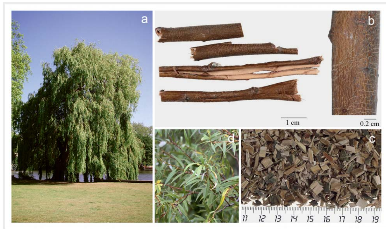
► Fig. 1 Clockwise from upper left: A willow tree (© PLANTAPHILE); B dried branches of Salix alba from which willow bark is harvested and a close-up of the bark (USP, Dietary Supplements Compendium (DSC) 2019, Supplementary Information, Illustrations, Salix Species Bark ); C chopped willow bark material of commerce (© PLANTAPHILE); D willow leaves (© PLANTAPHILE).

In the U.S., willow bark is a dietary ingredient in numerous DSs available in the market. Because of its popularity, the United States Pharmacopoeia (USP) developed quality standards for willow bark ingredients under the title Salix Species Bark . Prior to developing a DS monograph, USP customarily performs an Admission Evaluation [8]. This evaluation was done following the guidelines for admission of DSs into the monograph development process [9], and includes an assessment to ascertain that an ingredient does not present a serious risk to human health. The USP quality monographs include the name/title of the ingredient, the definition, specifications, and instructions for packaging, storage, and labeling requirements. The specifications consist of a series of tests, procedures for the tests, and acceptance criteria [10]. These tests and procedures require the use of official USP Reference Standards [11]. In this paper, we focus on the safety of willow bark as a dietary ingredient in DSs and present a case for the need to include a label caution statement on DS products containing willow bark that claim compliance with USP standards for willow bark.