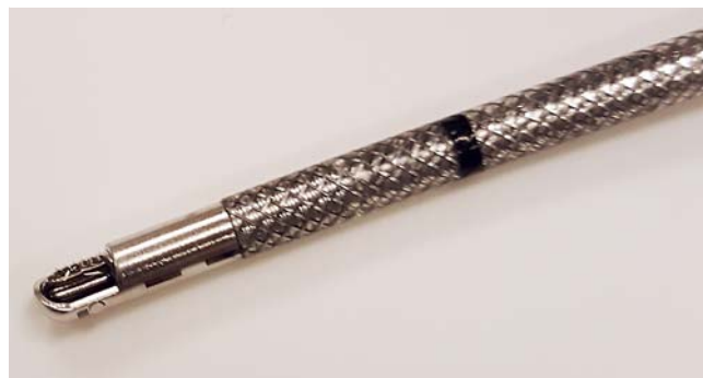
► Fig. 1 The EndoRotor.

This prospective study took place at the Department of Gastroenterology and Hepatology of the Erasmus MC, University Medical Center in Rotterdam, a tertiary referral center in the Netherlands and at the Medizinische Klinik II, Sana Klinikum Offenbach in Offenbach, Germany. We recorded data on patient demographics, clinical presentation, etiologies of acute pancreatitis, American Society of Anesthesiologists' (ASA) Physical Status Classification score [12], radiologically defined size of the necrotic collection in a transverse computed axial tomographic image displaying the largest diameter of the necrotic cavity, procedural details, and adverse events during and after endoscopic necrosectomy. All patients with symptomatic walled-off pancreatic necrosis (WOPN) were considered eligible for this study.