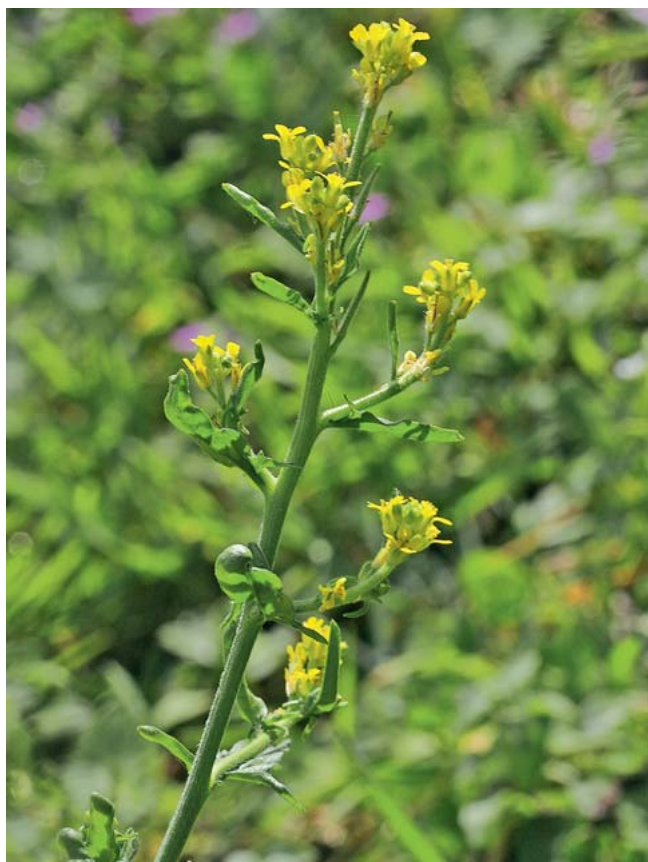
► Fig. 1 Sisymbrium officinale (L.) Scop. (hedge mustard) collected from Codoleddu, Cagliari, Italy.

Commonly called “the plant of singers” (in Spanish, “Hierba De Los Cantores”; in German, “Weg-Rauke or Gewöhnliche Rauke”), as its infusion is often ingested before an artistic performance. This plant is used for the treatment of respiratory tract diseases, such as pharyngitis, laryngitis, cough, aphonia, common cold, sore throat, and more rarely asthma [3]. It also shows antimicrobial, antimutagenic, and muscle relaxant activities, although these properties are less known and less exploited. Moreover, consumption of SO is suggested to smokers due to its anti-inflammatory and antioxidant effects [4]. It is of note that the use of SO was observed more than 2000 years ago in Greek and Roman times, when this plant as a practice was empirically used for treating many diseases, including mastitis, orchitis, and some tumors (without solid medical support) [5].