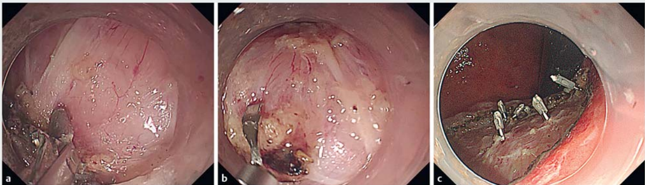
► Fig. 1 A modified search, coagulation, and clipping method for preventing delayed bleeding after gastric endoscopic submucosal dissection. a First, a coagulation procedure was done after lesion resection, mainly in the vessels at the margin of the ulcer base. b Perforator vessels may also be present in carbonized areas of the ulcer base. Clipping was also actively performed in such areas, which is the modification of the search, coagulation, and clipping approach. c The modified approach was completed.

Department of Gastroenterology, Kushiro Rosai Hospital, Kushiro, Japan