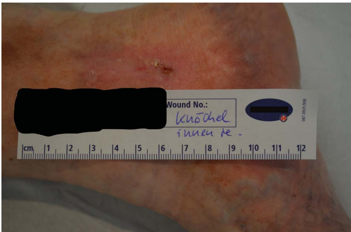
Fig. 3 After ligation of the perforator and exhairesis of the proximal venous vein, as well as foam sclerotherapy of the peri-ulcerous veins, the ulcer has regressed completely, relapse free to this moment.