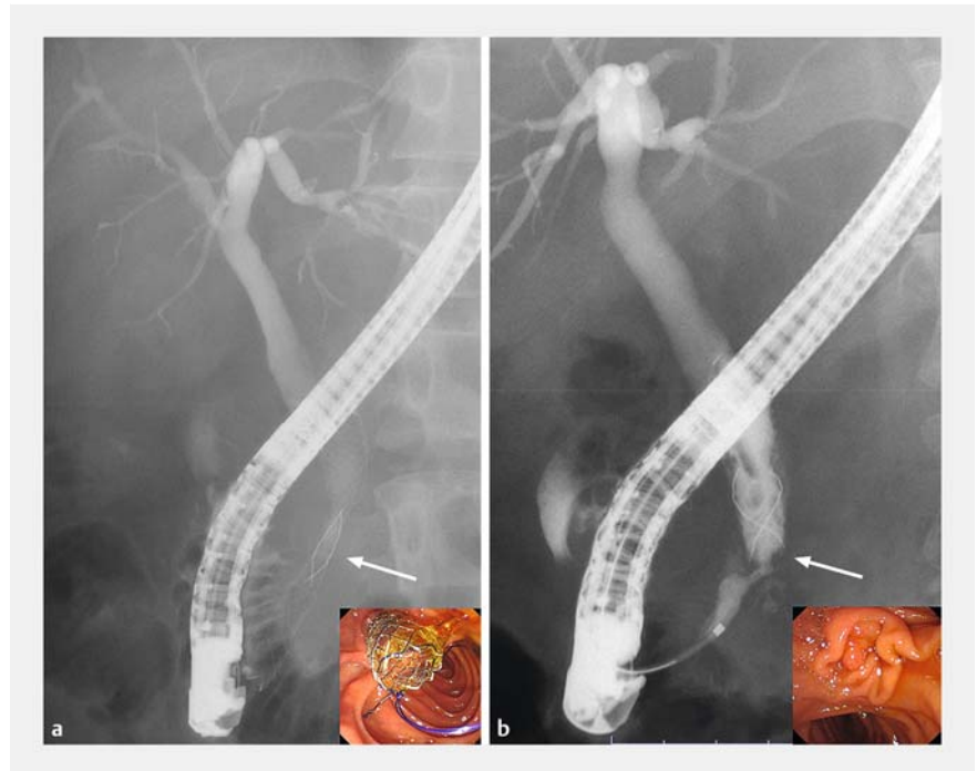
► Fig. 1 a A 10-mm-diameter, fully covered, self-expandable metallic stent (FCSEMS) placed across the major duodenal papilla in a 45-year-old man. b The FCSEMS fractured in the mid-portion with the inferior end of the stent located above the distal bile duct stricture.

No standard methods have yet been established for removal of fractured FCSEMS. Therefore, a variety of devices should be used as appropriate for each individual case.