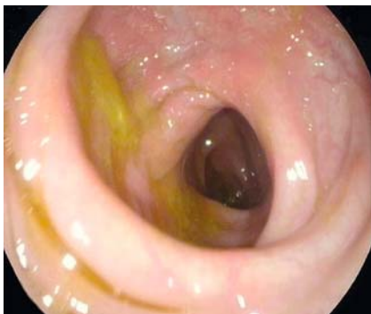
► Fig. 1 Mild erythema in the mid transverse colon of a 38-year-old patient with bloating and nonspecific abdominal pain.