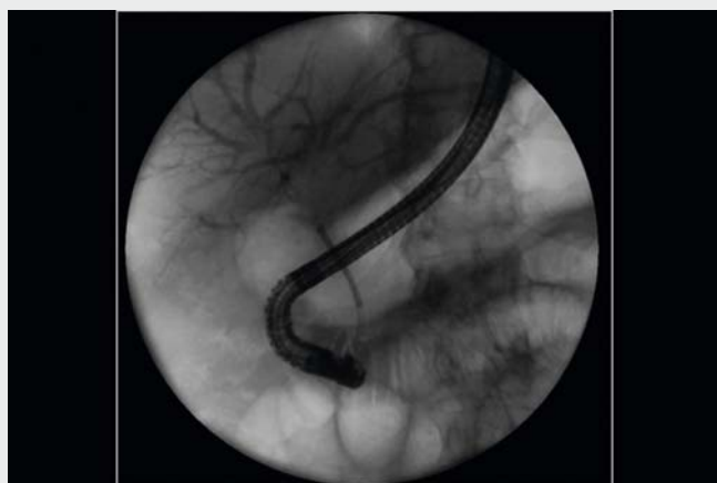
Video 1 Case of Mirizzi's syndrome treated with laser lithotripsy by direct peroral cholangioscopy.

No complications were reported and the patient was discharged after 3 days.