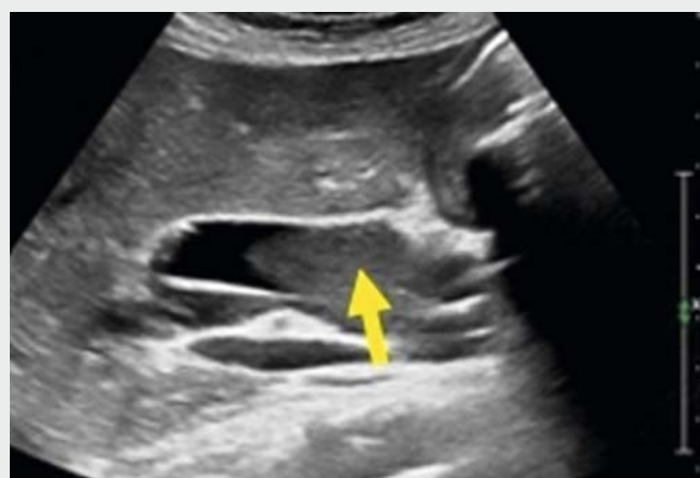
► Video 1 Endoscopic retrograde transabdominal ultrasound-guided bile duct drainage.