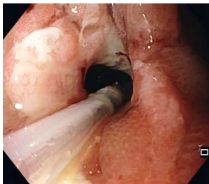
▶ Fig. 2 Instillation of cyanoacrylate sealant.