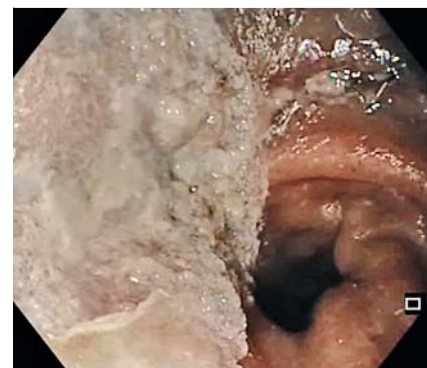
▶ Fig. 3 Cyanoacrylate clot.