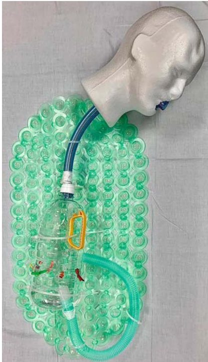
► Fig. 1 Components of a low-cost model for endoscopy training.

The coronavirus disease 2019 (COVID-19) pandemic has significantly impacted gastroenterology and endoscopy training. Nonurgent endoscopies have been postponed; trainees have been redeployed; and trainee participation in endoscopies that are still being executed has also been limited [1].