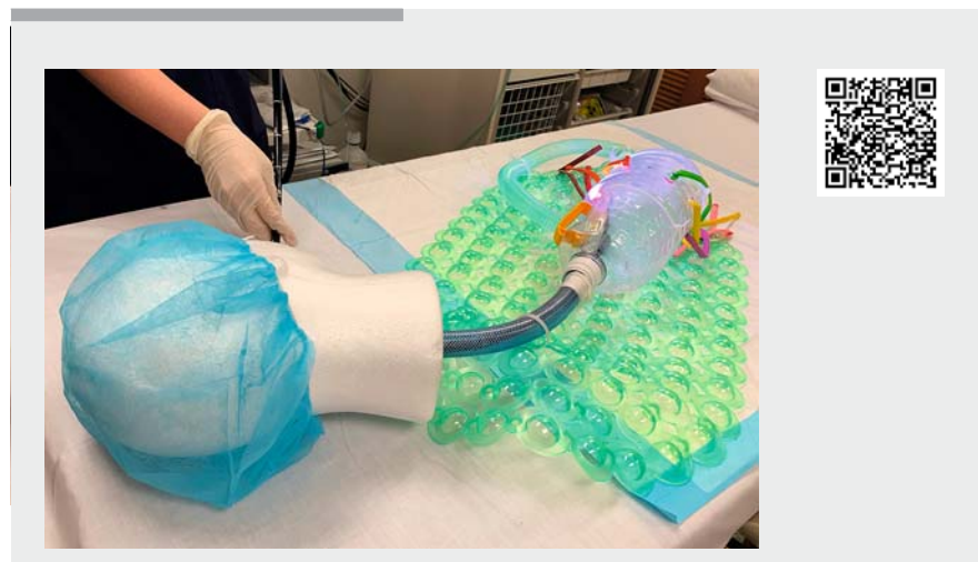
► Video 1 A low-cost endoscopy training model for novice endoscopy training.

for endoscopic education. This can help trainees develop the manual dexterity and familiarize themselves with the basic technical skills required prior to moving on to actual patients.