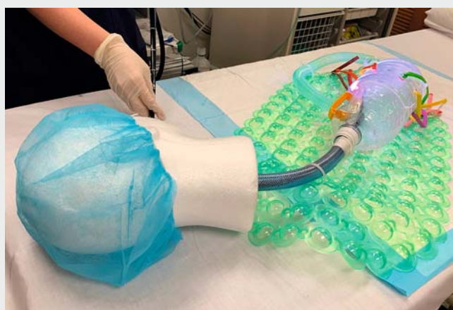
► Video 1 A low-cost endoscopy training model for novice endoscopy training.

for endoscopic education. This can help trainees develop the manual dexterity and familiarize themselves with the basic technical skills required prior to moving on to actual patients.