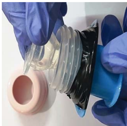
► Fig. 3 Invert the nipple into the bottle neck and screw down the collar.