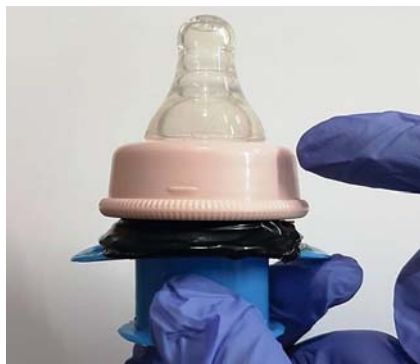
► Fig. 1 Attach the upper part of a baby's feeding bottle to the mouth guard.