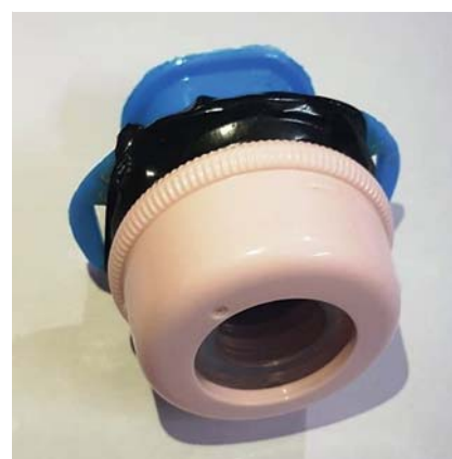
► Fig. 4 Perspective view of the novel mouth guard.

Take a plastic feeding bottle and cut off the upper end at the neck. Fix this upper end of the bottle to the mouth guard (► Fig. 1 ). Then take the nipple and make a small slit across its top (► Fig. 2 ). Invert the nipple (► Fig. 3 ), place it in the bottle neck, and screw down the collar tightly