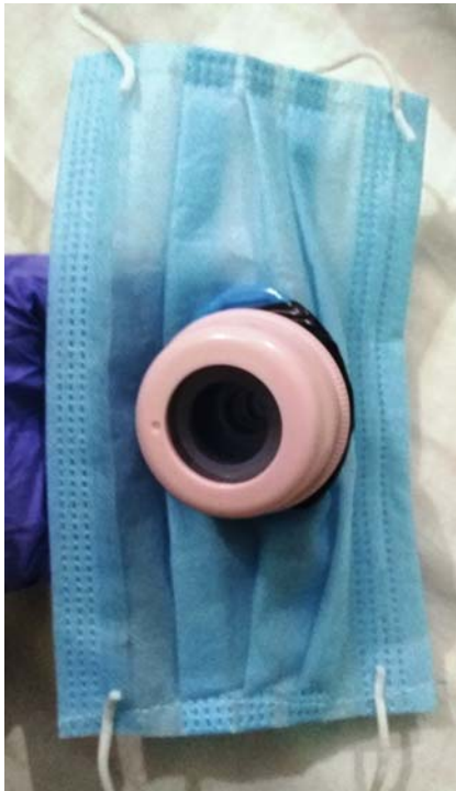
► Fig. 5 Novel mouth guard in place in a triple-layer mask, ready for use.

these changes. We have demonstrated the efficacy of our device by performing a simple experiment simulating endoscopy and aerosol generation (► Video 1 ). Our device is cheap, easy to make, reusable, and allows us to do endoscopy more safely during this COVID era.