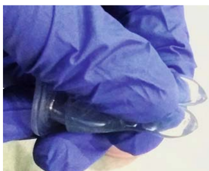
► Fig. 2 A silicon nipple with a slit functions as a valve.