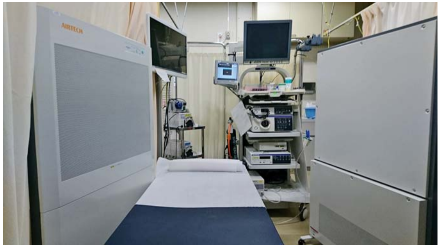
► Fig. 1 Portable partitions with high-efficiency particulate air (HEPA) filters were placed in the endoscopy unit.

We have placed in our endoscopy units portable partitions with high-efficiency particulate air (HEPA) filters. The HEPA designation requires that a filter capture 99.97% of particles \geq 0.3\mu\text{m} in size in that pass through it. Knowledge of HEPA filter functionality and prior Centers for Disease Control and Prevention (CDC) guidance for SARS-CoV-1 suggest the theoretical efficacy of HEPA filters for removing airborne SARS-CoV-2 [5]. To arrange the HEPA partitions properly, we evaluated the efficacy of placement by using CO 2 generated from dry ice. Partitions with filters were placed on both sides of the endoscopy unit ( ► Fig. 1 ). The partition placed near the patient's back draws in air flowing over the patient, whereas the partition placed on the patient's ventral side draws in air from the adjacent endoscopic unit and its output is filtered air. By adjusting the position of the partition and the operator, airflow can be directed toward the patient's back ( ► Fig. 2 and ► Video 1 ). Combination devices with mechanical protection like the C-Cube [4] and a clean partition may be one countermeasure for ensuring the removal of aerosols containing SARS-CoV-2.