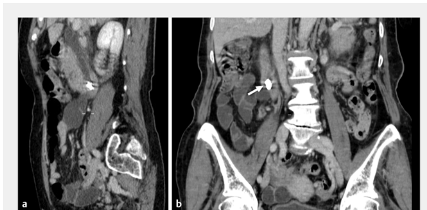
► Fig. 1 Computed tomography scans showing: a on sagittal view, dilatation of the main biliary duct and the presence of a foreign body in the peripapillary area; b on coronal view, the presence of a foreign body in the peripapillary area (arrow).

Foreign bodies may lead to a wide variety of complications, although the majority of foreign bodies will be passed spontaneously; among the elderly, the most common object is a dental prosthesis [1]. To the best of our knowledge, this is the only reported case of an impacted denture causing jaundice. We are unable to explain the possible way in which the denture could have got into the papilla, although such an occurrence is known to be possible because there are other reports of foreign bodies in the biliary tract, including toothpicks and surgical clips [2–4]. The speculated mechanism is reflux from the duodenum [5]. In this case, the sphincterotomy led to a fast resolution of the biliary obstruction and the patient was discharged a few days later. Because the majority of the ingested foreign bodies are unintentional and asymptomatic, the true incidence is diffi-