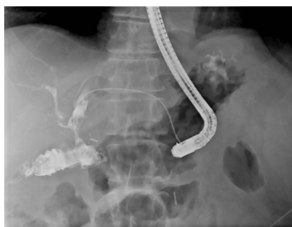
► Fig. 5 Second revision after 3 months showing complete resolution of the biliary leak, after which two new double pigtails were placed ultimately to be removed after 3 months.