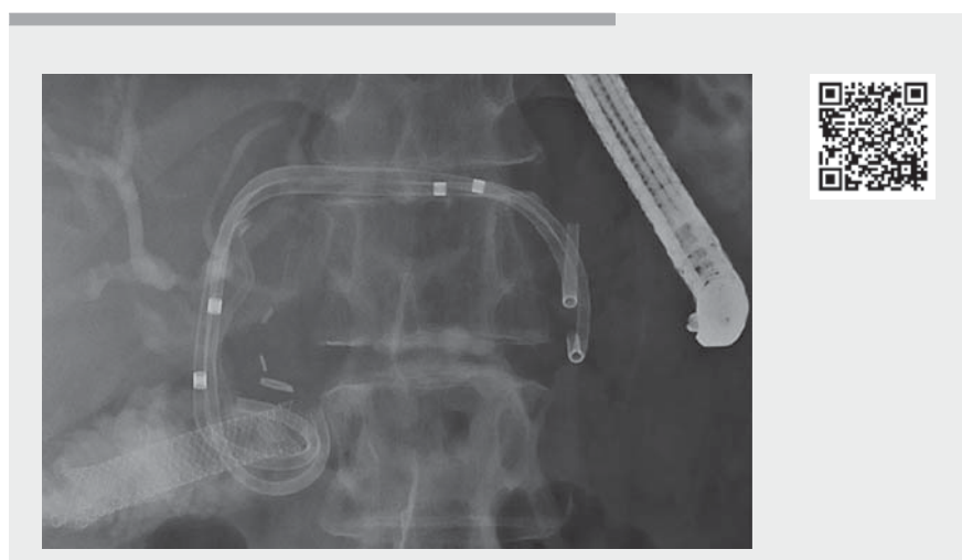
► Video 1 Endoscopic ultrasound-guided hepaticogastrostomy for an anastomotic biliary leak.

ary diseases. In this context, double-pigtail stents can provide secure drainage and long-term patency as well as minimize the risk of migration.