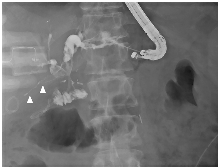
► Fig. 2 Fluoroscopic image showing successful endoscopic ultrasound-guided access to the left hepatic duct using a 19-gauge needle and 0.035-inch guidewire. A linear contrast opacification can be appreciated just below the liver, compatible with the biliary leak (arrowheads).

Our case illustrates that in patients with benign indications and impossible/failed retrograde access, EUS-guided HPG may ensure an effective long-term gateway to definitive endoscopic treatment of bili-