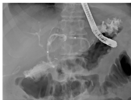
► Fig. 4 Revision 2 weeks after the index procedure and replacement of the fully covered self-expandable metal stent by a 10-cm double-pigtail stent.