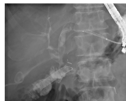
► Fig. 3 Fluoroscopic image revealing distal migration of the self-expandable metal stent (SEMS) into the small bowel lumen, while another fully covered SEMS is being placed into the left bile duct, creating an EUS-guided hepaticogastrostomy. Both the migrated SEMS and double-pigtail stent were scheduled for double-balloon enteroscopy-assisted retrieval after completion of endoscopic biliary leak treatment.