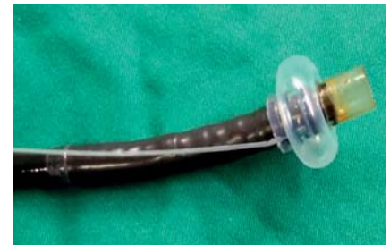
► Fig. 3 A self-designed balloon, together with a transparent cap, was attached to the distal end of the endoscope and inflated with 20 mL of air, expanding its outer diameter from 1.3 cm to 3.5 cm.