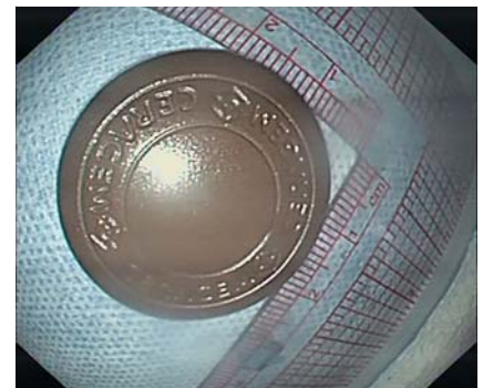
► Fig. 4 The round-shaped stone was extracted using a disposable polypectomy snare after being pushed into the stomach.

sharp objects. Thus, we highly recommend balloon-assisted endoscopy as a feasible technique worthy of clinical promotion.