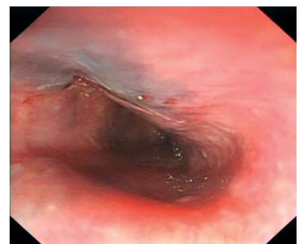
► Fig. 5 Mild hematoma and mucosal injury were observed at the original site of the stone, but without perforation, infection, or other complications.

The Anhui Science and Technology Department: 2018 Key Research and Development Plan Projects 1804h08020260