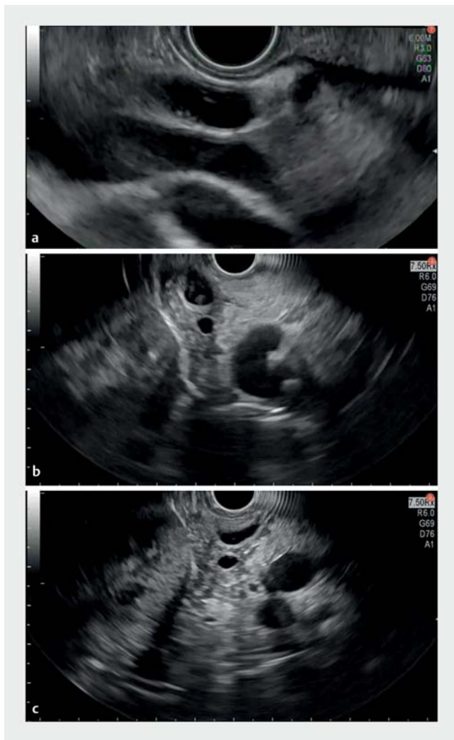
► Fig. 1 Images of evaluated EUS videos. Microlithiasis, sludge or artifact?

Secondary endpoints were the interobserver agreement on the need for ERC+ES (yes/no) and differences in interobserver agreement between experts and non-experts.