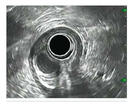
► Fig. 2 Endoscopic ultrasound view showing the cystic lesion in the antrum.