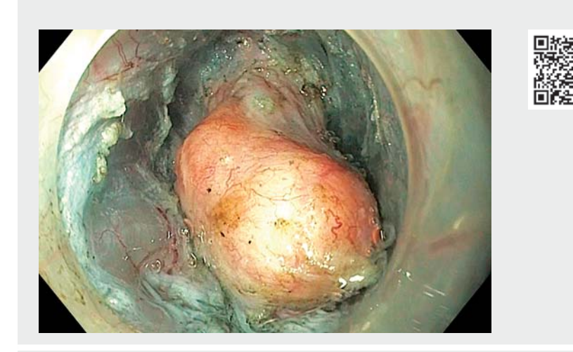
Video 1 Technique of submucosal tunneling endoscopic resection (STER) in a patient with a gastric duplication cyst.

on imaging, especially endoscopic ultrasound [3]. Traditionally, surgery has been used for the management of these lesions. With recent advancements in therapeutic endoscopy, a substantial proportion of these lesions can be resected using submucosal endoscopy techniques [4].