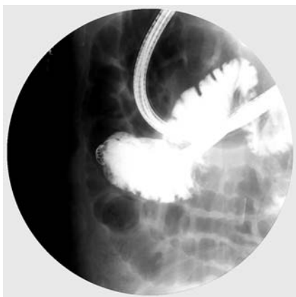
► Fig. 3 Fluoroscopic image showing a large volume of contrast being injected after deployment of the over-the-scope clip, with no evidence of further leakage.

sion, we have demonstrated that an enteroscope-mounted OTS clip placed during BAE is a safe and feasible option for a small-bowel fistula.