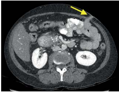
► Fig. 1 Computed tomography scan of the abdomen revealing a communication between the jejunal loops and the skin, consistent with an enterocutaneous fistula.