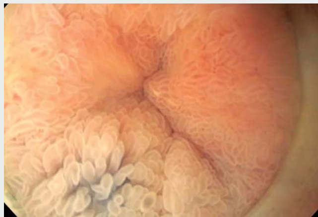
► Video 1 Closure of an enterocutaneous fistula using a single-balloon enteroscope preloaded with an over-the-scope clip.

ECFs have devastating consequences if left untreated. Most case series have reported the safety and efficacy of mounting the OTS clip on either a gastro-scope or colonoscope [3]. The challenges in this case were appropriate selection and mounting of the fitting device onto the enteroscope, being able to safely traverse the small bowel, and achieving good visualization, apposition, and delivery for successful closure. In conclu-