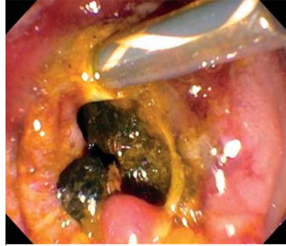
► Fig. 2 Endoscopic image: the balloon could not be deflated even after we cut the catheter close to the handle.