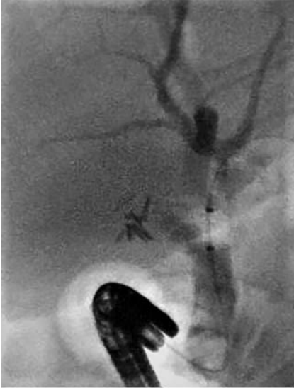
► Fig. 1 Fluoroscopic image: after several attempts of downward pulling on the balloon catheter, aiming for stone expulsion, we were unable to deflate the balloon.