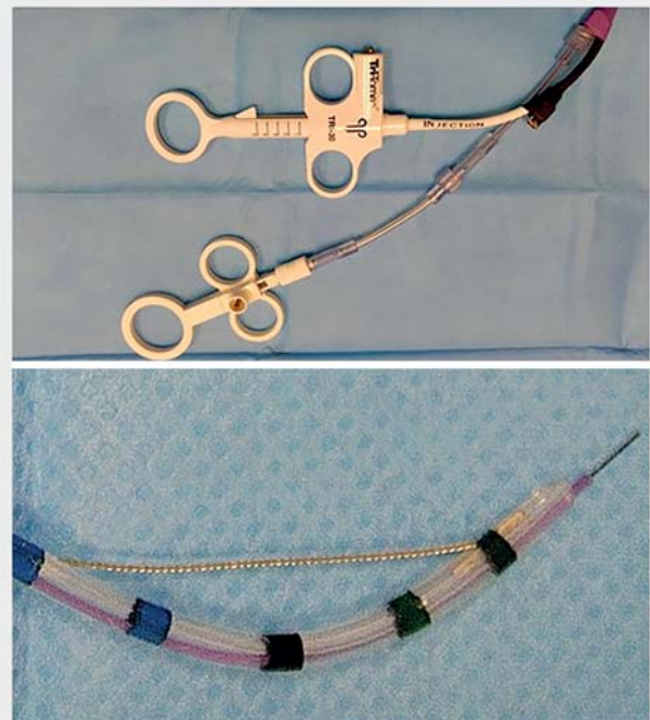
▶ Fig. 1 The CC-HT. Two pieces were combined to adapt the cannulotome guidewire channel to the needle-knife core length.

channel (▶ Video 1 ). Because the lengths of the two devices are not consistent, the channel of the CT was extended by using one or more serial connectors until only the needle emerged from the tip when the handle was in the extended position (▶ Fig. 1 ). The CT we used were Clever-Cut 3V (Olympus, Tokyo, Japan) (OC-HT), True-Tome 44 (Boston Scientific, Natick Massachusetts, United States) (BSC-HT) and Tri-Tome 30 (Cook Medical, Bloomington Indiana, United States) (CC-HT) devices (▶ Fig. 2 ).