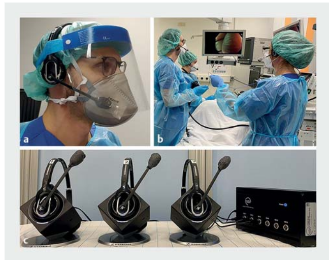
► Fig. 1 a DECT Intercom Headset with FFP3 and face shield in use for COVID-19 high-risk examinations. b Digital enhanced team communication within colonoscopy, endoscopist (left front), assisting nurse (right) and sedation performed by nurse (back left). PPE with FFP2 mask, hair net, gown and gloves for moderate risk stratification. c (Left) Cordless DECT Intercom Headsets with microphones on cubic charging station, noise-cancelling microphones equipped with disposable mike protector. (Right) Controller for connected audio communication (Intercom Box)

All endoscopic procedures were performed by experienced endoscopists and skilled nurses in a team of three. The team members changed on a weekly base according to working sche-