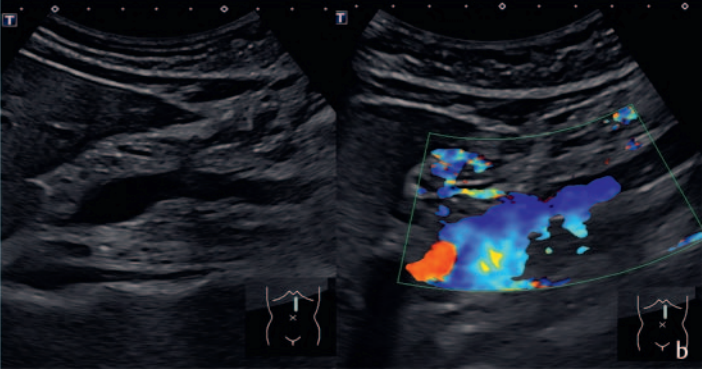
▶ Fig. 2 Recanalization of the portal vein a and mesenteric vein b. B-mode US image (left side) and color Doppler image (right side).

persons below the age of 60. Some of the cases described ended fatally or with permanent damage [5].