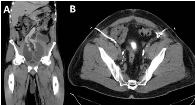
► Fig. 2 Successful drainage catheter placement in a patient 43 days post-prostatectomy with symptomatic postoperative lymphoceles. A In total, three lymphoceles could be detected on CT scan. The third smaller lymphocele on the left side cranial to the two in the pelvis was assessed as non-symptomatic and was therefore not treated. B The CT image shows the result after double-sided drainage catheter placement in the lymphoceles neighboring the iliac vessels which causes total deflation of lymphocele cavities and immediate pain relief.