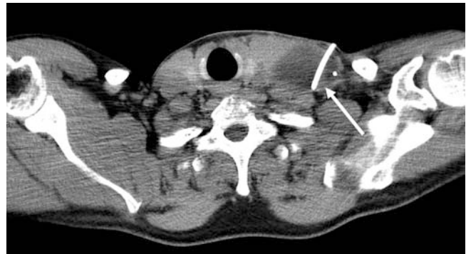
► Fig. 4 Drainage catheter placement in a symptomatic cervical lymphocele post-lymph node excision with the patient suffering from fever and pain failed to cure the lymphocele completely. Even after 10 days of catheter drainage (white arrow), the lymphocele was still visible. The positive effect of the drainage procedure was symptom relief.

Existing literature has reported that most symptomatic lymphoceles have a diameter exceeding 5 cm [8]. In our patient