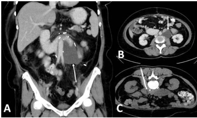
► Fig. 3 Successful drainage catheter placement in a female patient with symptomatic lymphocele 22 days after extended tumor surgery due to ovarian carcinoma. A paraaortal lymph node excision was performed as well. The patient suffered from disturbed gastric and duodenal transit because of a retroperitoneal lymphocele compressing the distal duodenum (white arrow in A and B ). Drainage catheter placement was carried out with the patient in prone position using the trocar technique. C shows the result after drainage catheter placement with total deflation of the lymphocele cavity and relief of symptoms.

► Abb. 3 Erfolgreiche Drainageeinlage in eine Patientin mit symptomatischer Lymphozele 22 Tage nach ausgedehnter Tumoroperation aufgrund eines Ovarialkarzinoms. Eine Exzision der paraaortalen Lymphknoten wurde ebenfalls durchgeführt. Die Patientin litt an einer gestörten duodenalen und gastrischen Passage aufgrund der Kompression des Duodenum durch eine symptomatische Lymphozele (weißer Pfeil in A und B ). Die Drainageeinlage in Tokar-Technik wurde mit der Patientin in Bauchlagerung durchgeführt. C Diese Abb. zeigt das Resultat der Drainageeinlage mit einer totalen Deflation der Lymphozele. Die Patientin war danach beschwerdefrei.