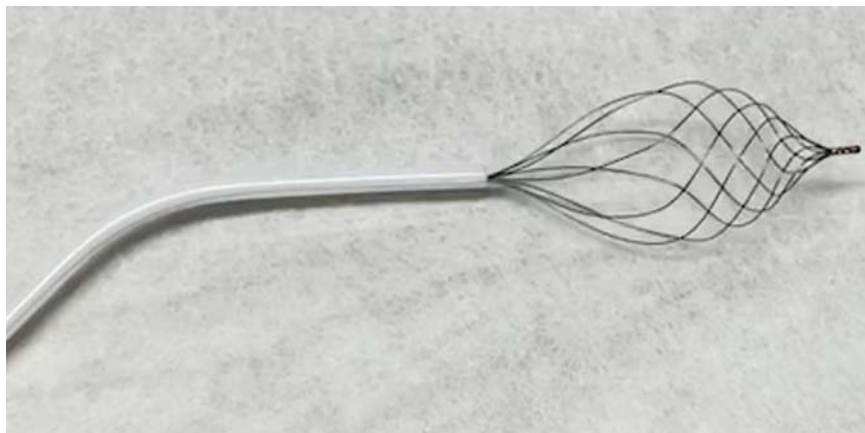
► Fig. 1 Novel RASEN basket catheter. The tip of the basket has a dense structure. The basket is very effective for removing small biliary stones.

A 69-year-old man with unresectable cholangiocarcinoma was admitted to our hospital owing to obstructive jaundice. At first, the inside stent was inserted in the anterior segmental branch for treatment of obstructive jaundice. However, he underwent endoscopic retrograde cholangiopancreatography 7 days later for additional biliary stent insertion in the posterior segmental branch owing to insufficient improvement in his jaundice symptoms. Although the posterior segmental branch was easily contrasted, the bile duct stricture was severe and required dilation using a thin balloon catheter (6-mm REN; Kaneka Medical). When insertion of the second biliary stent was attempted, the first stent migrated to the anterior segmental branch, and not only the distal end of the stent but also the nylon thread attached to the inside stent were not visible on the endoscopic image (► Fig. 2 a, b). We attempted to retrieve the migrated inside stent using the RASEN basket catheter. We inserted and opened the basket in the common bile duct and pulled it while slowly rotating it. Subsequently, we could easily grasp the nylon thread (► Fig. 2 c) and gently pull it. After returning the stent position without breaking the nylon thread, we released it in the duodenum. Finally, the second stent was inserted into the posterior segment branch without migration of the first stent (► Fig. 2 d, ► Video 1). The RASEN basket