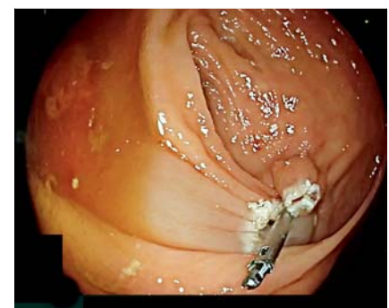
▶ Fig. 4 Closure of the scar.