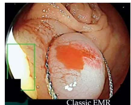
▶ Fig. 2 Endoscopic mucosal resection of the angiodysplasia.