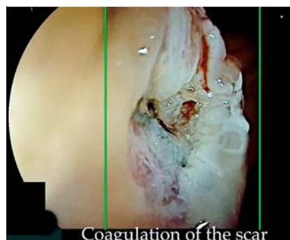
▶ Fig. 3 Scar after endoscopic mucosal resection.