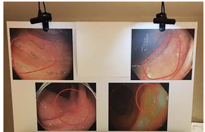
► Fig. 1 Polyp detection poster displayed above the screen in the endoscopy room.

Every physician was assigned a primary ASC. The colonoscopies were direct referrals and scheduled based on patient convenience. Physicians assigned to an ASC in the eastern twin cities metro area (N=44) were designated the intervention group and those assigned to an ASC in the western twin cities metro area (N=44) were designated the control group. This was a convenience design for this quality improvement project. During the study period, for the intervention group, a 2'×3' polyp sizing poster with pictures of SSLs and advanced adenomas was displayed in each endoscopy room, above the endoscopist