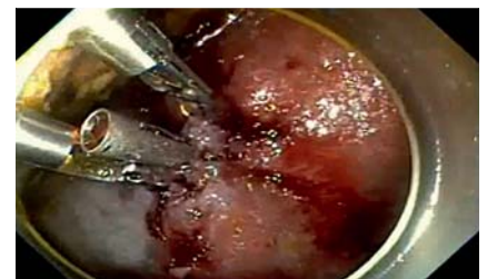
▶ Fig. 2 Successful closure of defect using two novel clips and one through-the-scope endoclclip.

whether it has any impact on surveillance examinations after endoscopic resection.