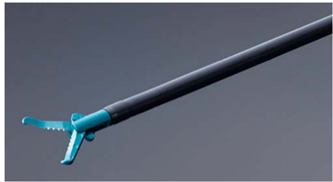
► Fig. 1 SB Knife GX. A scissor-type knife specialized for gastric endoscopic submucosal dissection.

ESD was performed under intravenous sedation with midazolam and pentazocine in the endoscopy unit; a single-channel endoscope (GIF-H260Z or GIF-Q260J; Olympus Corporation) with a standard-tip hood (Olympus Corporation) was used as previously described [25–28]. The local solution to the submucosa was a mixture of 0.4% sodium hyaluronate (MucoUp; Boston Scientific Japan K.K., Tokyo, Japan) and 10% glycerin solution, with a small amount of indigo carmine. A simple ESD pro-