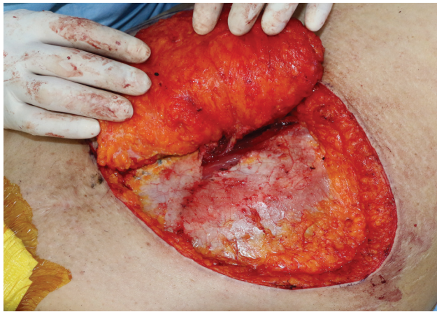
Fig. 2 Flap elevation is performed laterally to medially on the surface of the fascia. If perforators with a sufficient caliber are chosen, the anterior rectus sheath can be incised several millimeters around the perforators.

confirmed that the perforator has joined a branch of the deep inferior epigastric vessels. The motor nerves supplying the rectus abdominis muscle should always be spared. The pedicle is dissected in accordance with its required length, with efforts to preserve the nerves. Primary closure of the donor site is performed in all cases. Then, the vessels are anastomosed and the inserted flap is trimmed to fit the defect after the flap thinning procedure. If intraflap anastomosis of the bipedicle is required, it is performed after main vessel anastomosis. In two cases, the perfusion was evaluated with indocyanine green angiography.