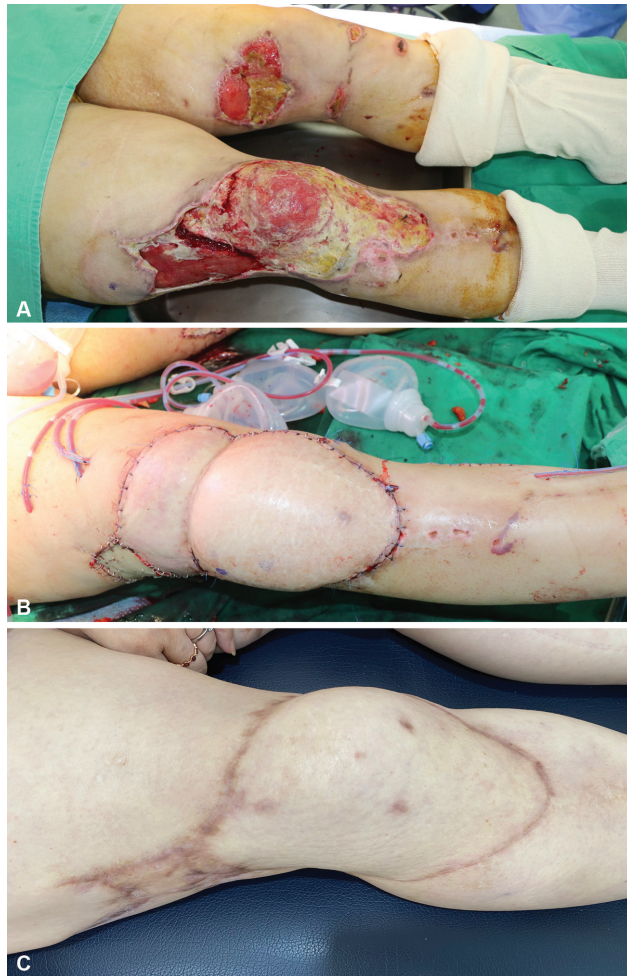
Fig. 3 (A) A skin and soft tissue defect in right upper thigh and knee area. (B) Coverage with a deep inferior epigastric perforator (DIEP) flap. (C) Long-term follow-up with full range of motion (ROM).

planned to use a DIEP free flap with a bipedicle pattern because approximately 100% of the full dimension (B/A) of the flap was to be insetted. The flap was elevated with two perforators of both medial rows and intraflap anastomosis was performed. The vessel was anastomosed with the posterior tibial vessels. The flap was insetted 100% after the flap thinning procedure. The postoperative course was uneventful except for temporary flap congestion. Two weeks later, the patient was discharged from the hospital. She was able to walk while wearing normal shoes (► Fig. 4).