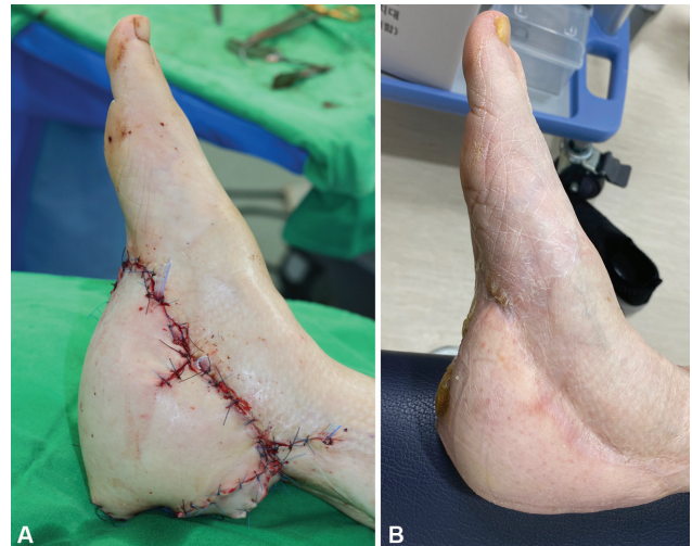
Fig. 4 (A) Coverage with a deep inferior epigastric perforator (DIEP) flap on a weight-bearing area. (B) Postoperative 25-month follow-up.

Adequate soft tissue reconstruction in large defects of extremities is particularly important to avoid unnecessary amputation and to aid in recovery of function. The advent of perforator flaps has allowed for a more “like-for-like” replacement of full-thickness skin defects with the same tissue type, even with large defects. They permit low morbidity of the donor site, versatility in flap design, and muscle preservation with less functional deficits; additionally, the texture is similar to that of the recipient site, which provides good aesthetic results. 7,8 Selection of a perforator flap is