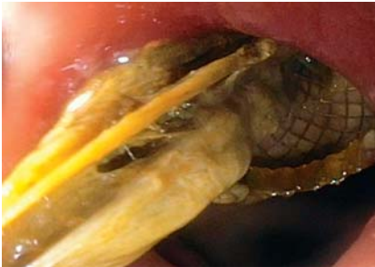
► Fig. 1 Endoscopic image of lumen-apposing metal stent obstructed with necrotic tissue.