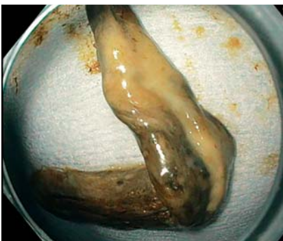
► Fig. 2 The largest specimen removed (9 × 1.5 cm) was sent for histopathological examination, which confirmed a necrotic gallbladder wall.

A 56-year-old man with liver, peritoneal, and lymph node metastases after previous transthoracic esophagectomy was diagnosed with acute calculous cholecystitis. Transduodenal endoscopic ultrasound-guided gallbladder drainage (EUS-GBD) was performed using a 10 × 10 mm cautery-enhanced lumen-apposing metal stent (LAMS). Purulent fluid was aspirated and submitted for culture, which identified Enterococcus faecium . After EUS-GBD the patient initially recovered well, but 3 weeks later fever and abdominal pain recurred. A computed tomography (CT) scan revealed a persistent hydropic gallbladder suggesting stent dysfunction. An upper endoscopy was then performed, which showed ob-