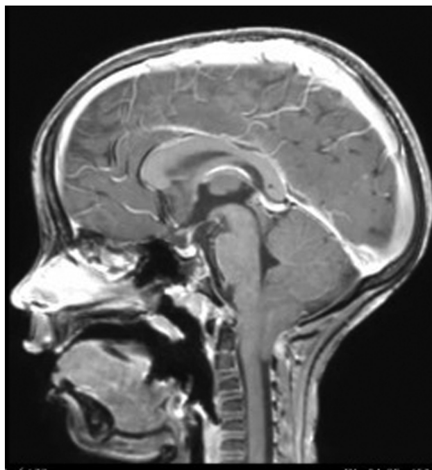
Fig. 1 Magnetic resonance imaging (MRI) showing Chiari malformation type I (CM-I).

A suboccipital craniectomy and C1 laminectomy were performed. Almost immediately after bony decompression, the patient had mild improvement in the left upper extremity MEPs as well as an 827% increase in the amplitude of the