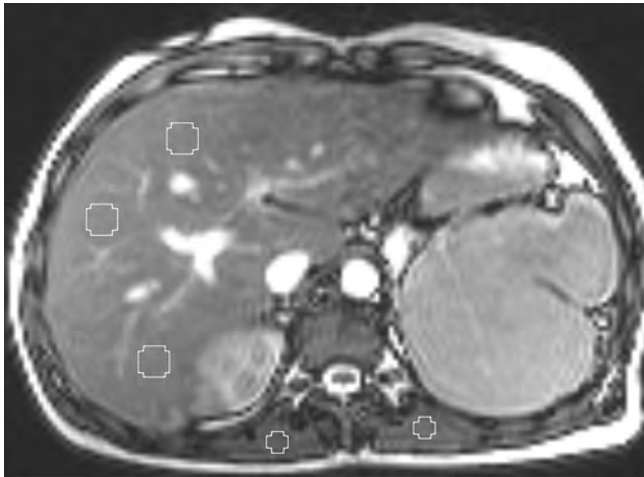
► Fig. 1 Example of a bSSFP image at a TR of 3.5 ms and 17° FA with three liver ROIs and two in the paraspinal muscles.

► Abb. 1 Beispiel eines bSSFP-Bildes mit einer Repetitionszeit TR von 3,5 ms und einem Anregungswinkel von 17° mit 3 ROIs in der Leber und 2 in der paraspinalen Muskulatur.